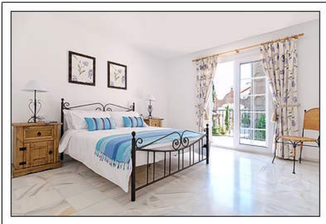
Bedroom I With Double Bed & French Doors To Terrace