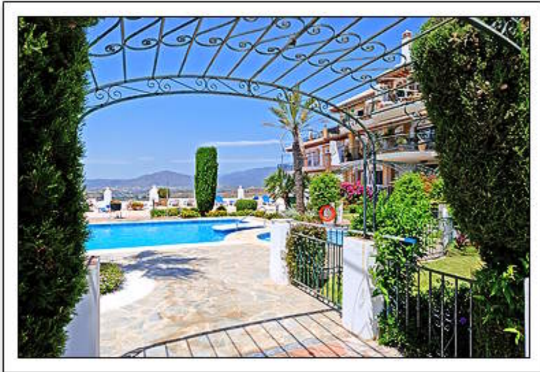
Communal Pool & Gardens