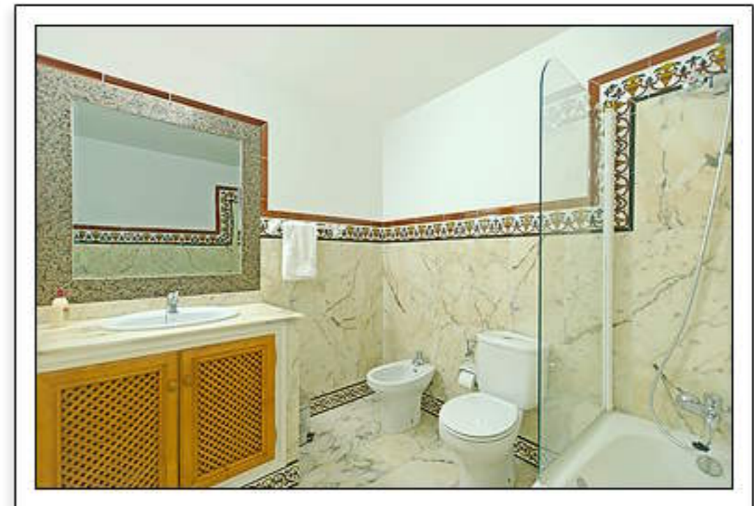
Bathroom (1 of 2) With Shower Over Bath