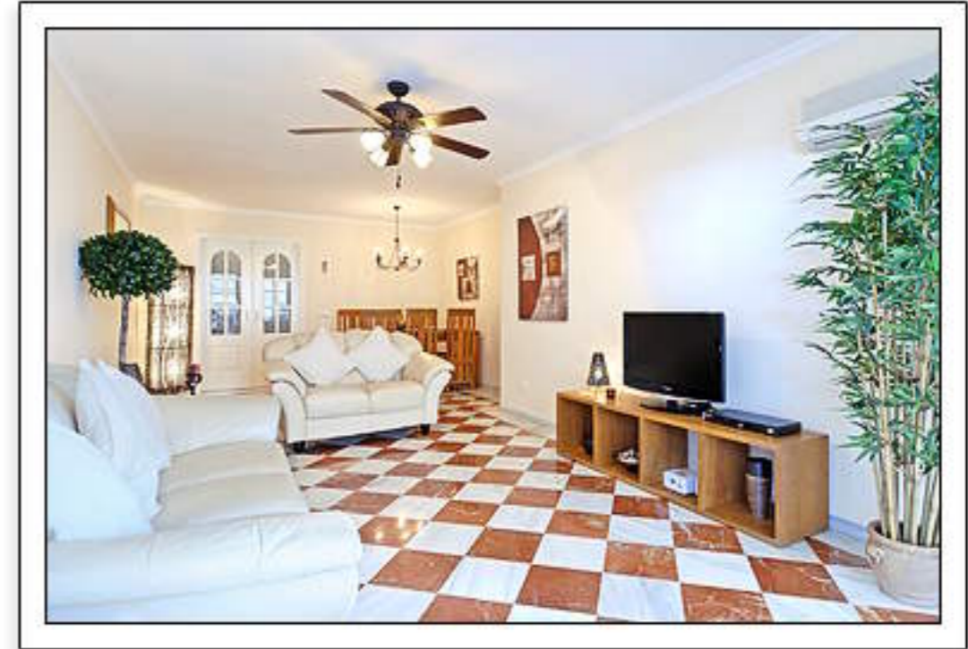
Open Plan Lounge & Dining Area With Doors Leading To Terrace