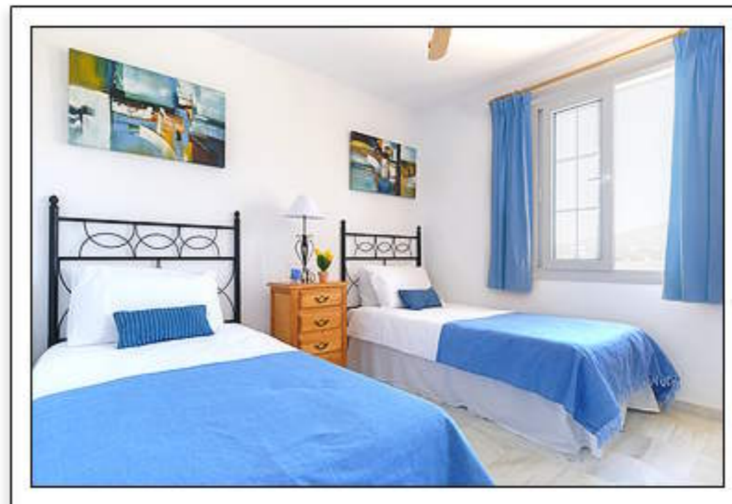
Bedroom 3 With Twin Beds