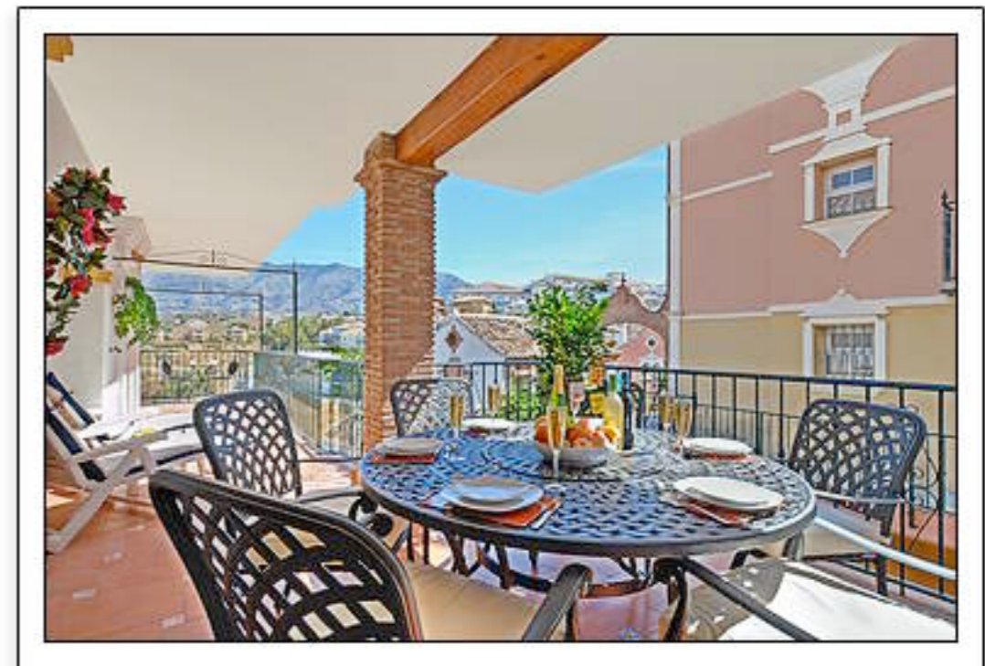
Large Terrace For Dining & Relaxing