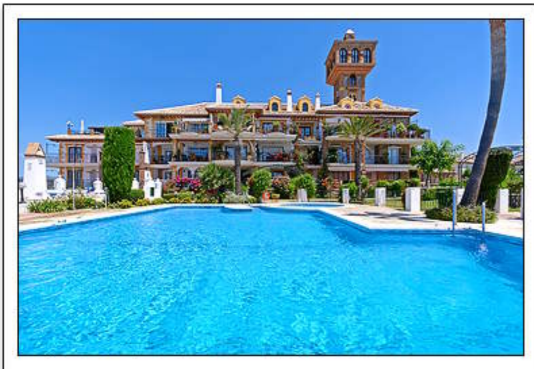
4 Communal Pools

Puebla Aida is located within the grounds of the Mijas Golf complex with two 18 hole golf courses designed by Robert Trent Jones Snr – Los Lagos and Los Olivos and only a short walk from the famous Hotel Byblos. Puebla Aida is only 20 min's from Malaga Airport, 10 min's from Fuengirola, 25 min's from the Cosmopolitan resorts of Marbella and 30 min's to the jet set resort of Puerto Banus.